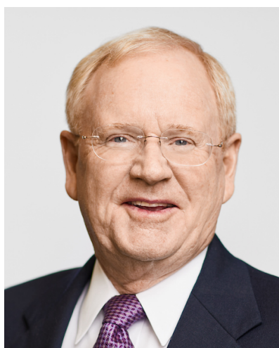
Principal Occupation: Managing Director and Senior Advisor, Platte River Equity, LLC