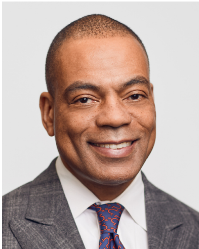
Principal Occupation: Partner, Hogan Lovells US LLP