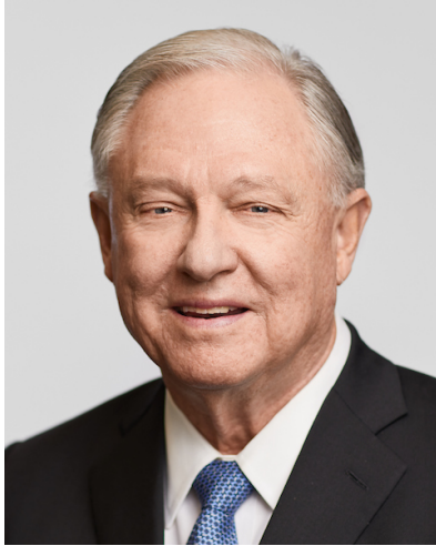
Principal Occupation: Individual Investor