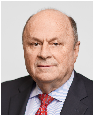
Principal Occupation: Individual Investor