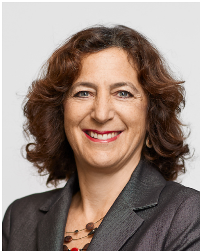
Principal Occupation: Professor of Electrical Engineering, Stanford University