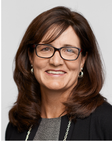
Principal Occupation: President, Asurion Corporation